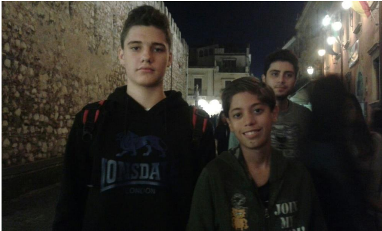
Me with my host.