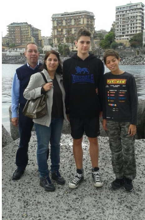
Me and my host family.