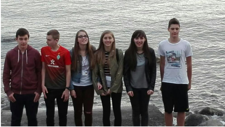
Me and students from Germany.